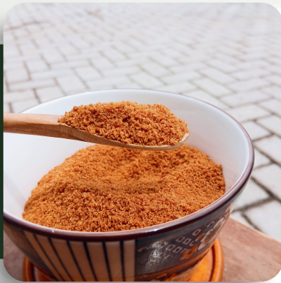
Arenga Palm Sugar