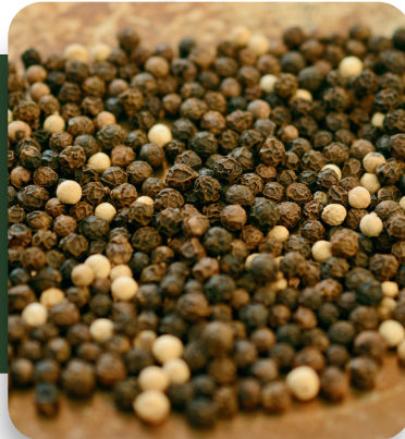
Black & White Pepper