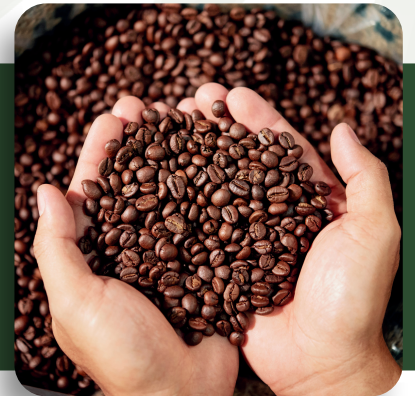
Roasted Coffee Beans