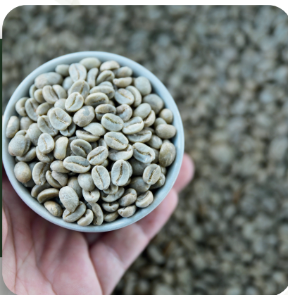
Green Beans Coffee