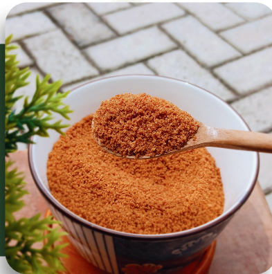
Coconut Palm Sugar